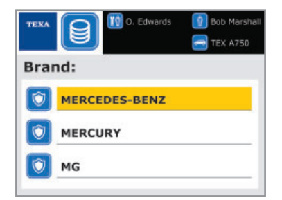
Easy Select Complete AC Service