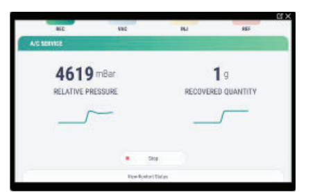
RECOVERY - Status / Remaining Time