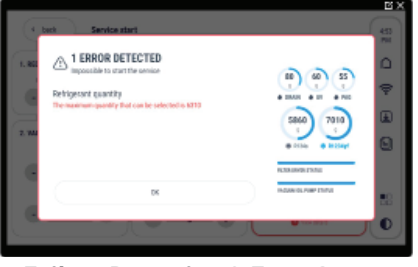
Failure Detection & Error Status