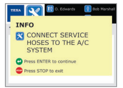
Clear Step By Step Messages