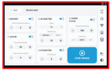
SINGLE SCREEN Operating Parameters