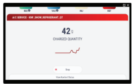
REFRIGERANT CHARGE - Status